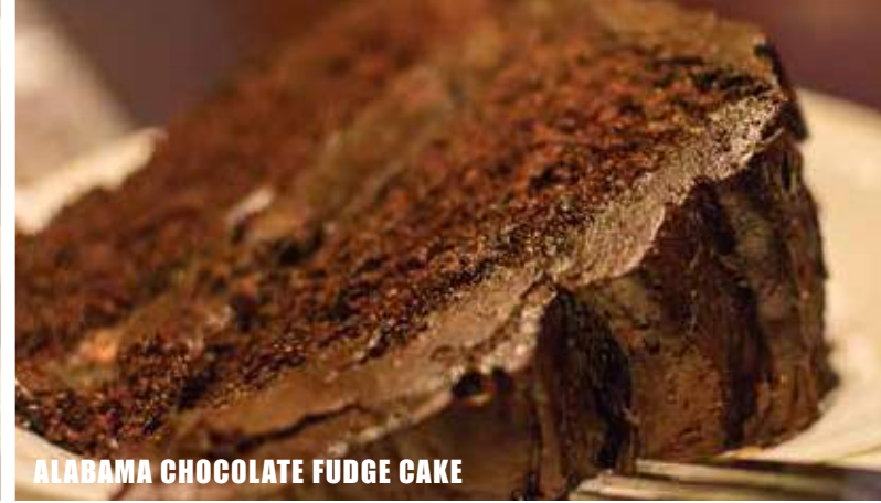
ALABAMA CHOCOLATE FUDGE CAKE