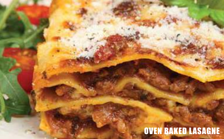
OVEN BAKED LASAGNE