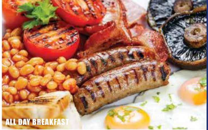
ALL DAY BREAKFAST