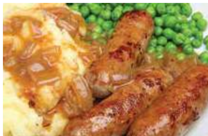
BANGERS & MASH