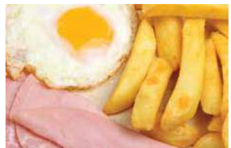
HAM, EGG & CHIPS