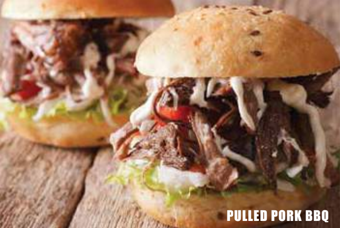
PULLED PORK BBQ