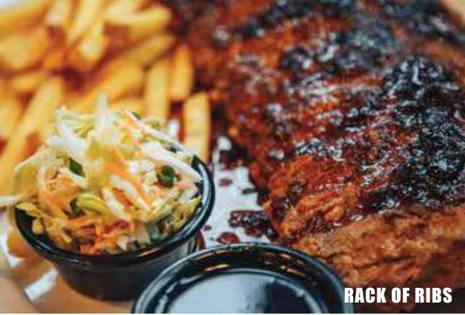
RACK OF RIBS