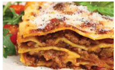
OVEN BAKED LASAGNE