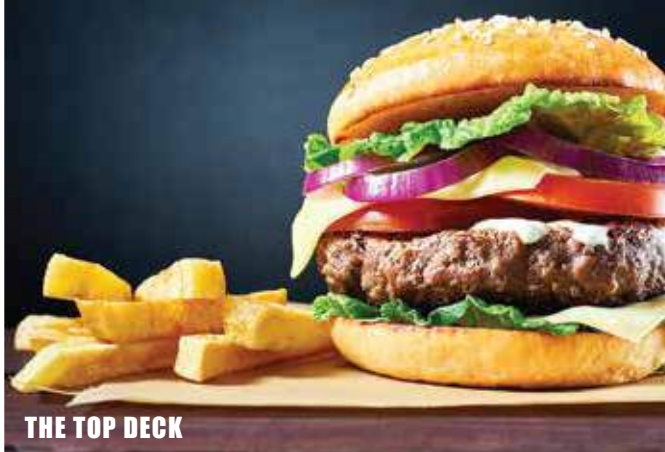
THE TOP DECK