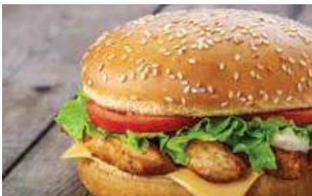
CHICKEN FILLET BURGER